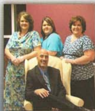
The Epps Family