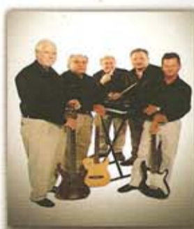
Engrace (House Band)