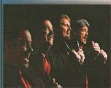
The Mystery Men

Join us for this 5-night cruise as we cruise the beautiful, turquoise waters of the Caribbean and enjoy the best in Gospel Music!